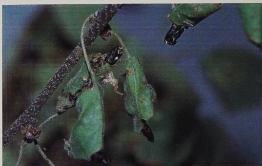
Figure 6. Tortrix pupal cases.

Take-No-Action Approach: An aspen tree that is healthy and growing well can withstand a few years of tortrix feeding. The tree's diameter and height will not be adversely affected; serious damage or death is uncommon. To assure good tree vigor, the following steps should be taken: